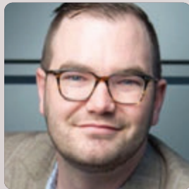
JONATHAN QUICK Social Media